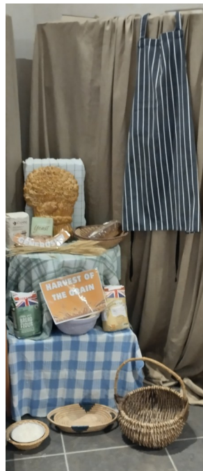
Harvest of the Grain