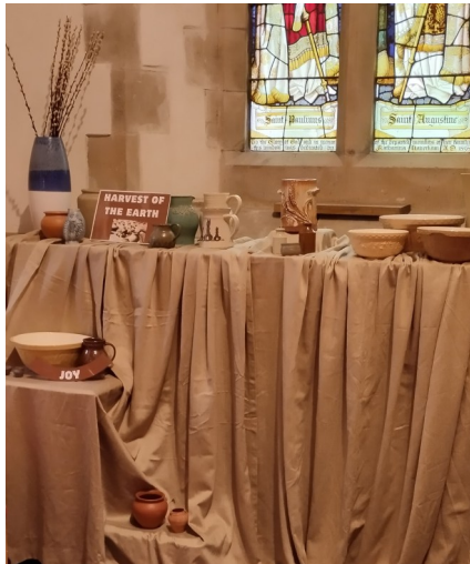
Harvest of the Earth