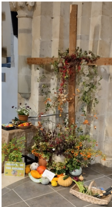
Harvest of the Garden