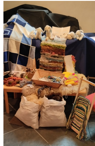
Harvest of the Flock